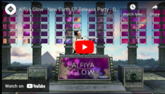
groove cruise live